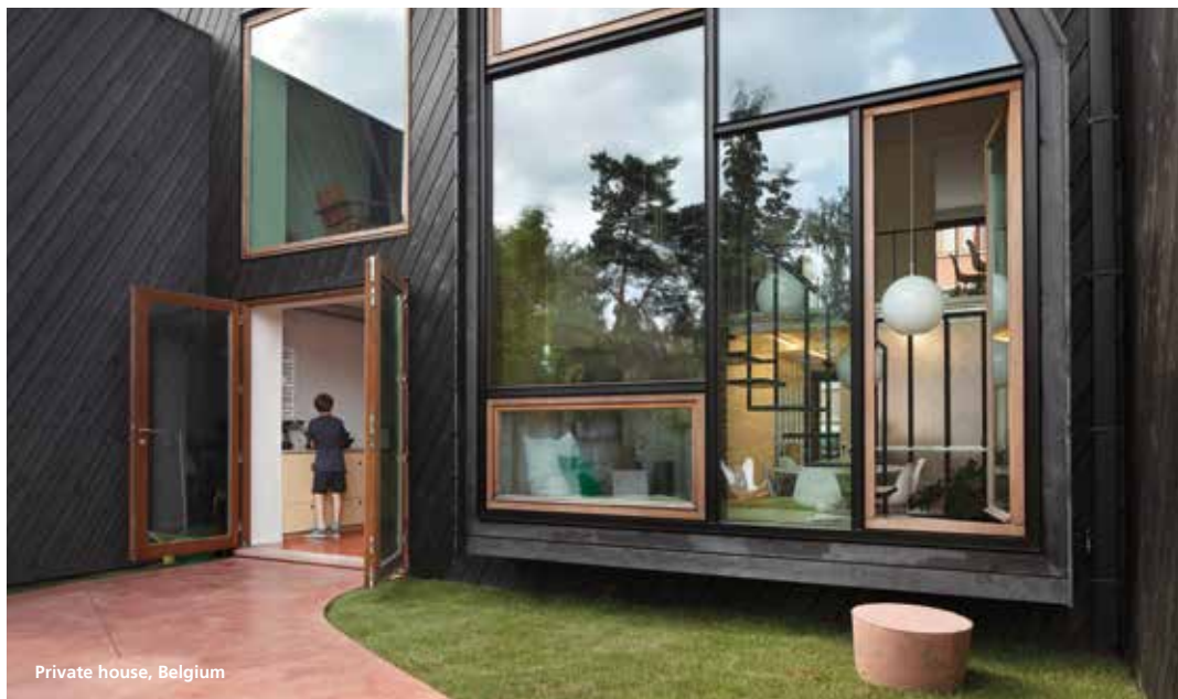
Private house, Belgium