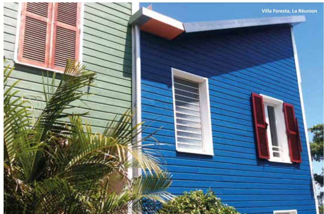
Villa Foresta, La Réunion