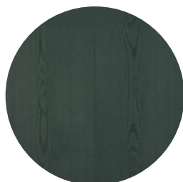
RUBIO MONOCOAT GREEN