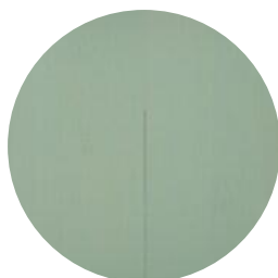
SALT LAKE GREEN