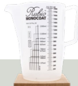
Measuring Cup 1800 ml

Measuring cup to mix products (some of our products need to be combined with an Accelerator or Softener)