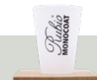
Measuring Cup 350 ml

Measuring cup to mix products (some of our products need to be combined with an Accelerator or Softener)