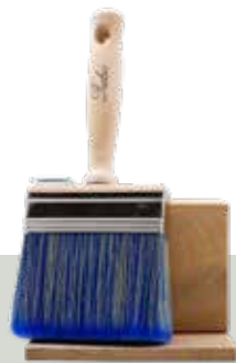
Block Brush 3x10

Perfect for applying WoodCream and WoodCream Softener • Ensures an even application • Very durable: high quality and stainless steel (inox) • Perfect for processing water-based products • After use with WoodCream, you can simply rinse the brush with water