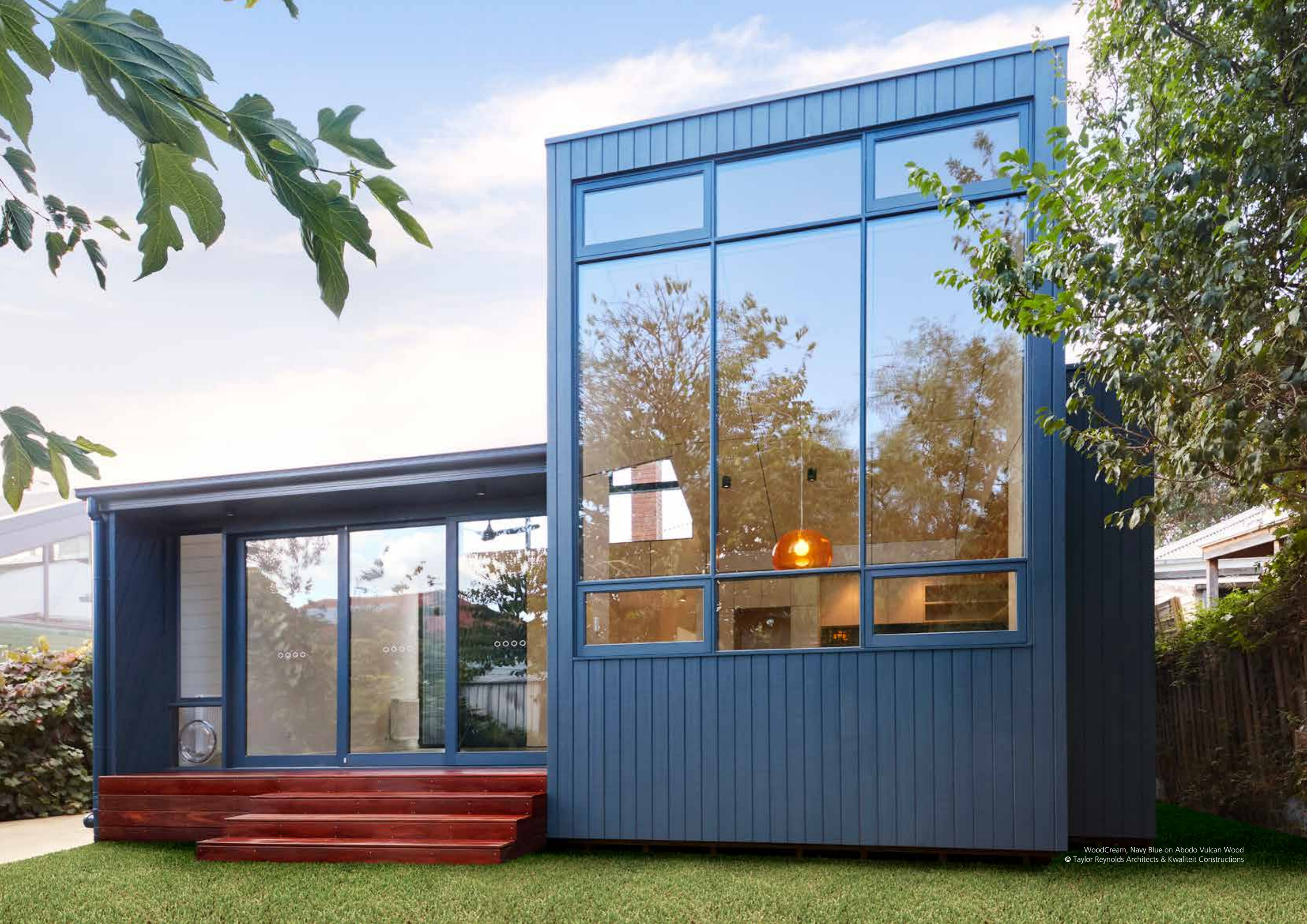
WoodCream, Navy Blue on Abodo Vulcan Wood © Taylor Reynolds Architects & Kwaliteit Constructions