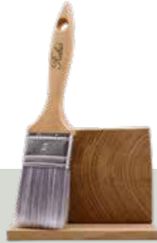
WoodCream Brush 2"